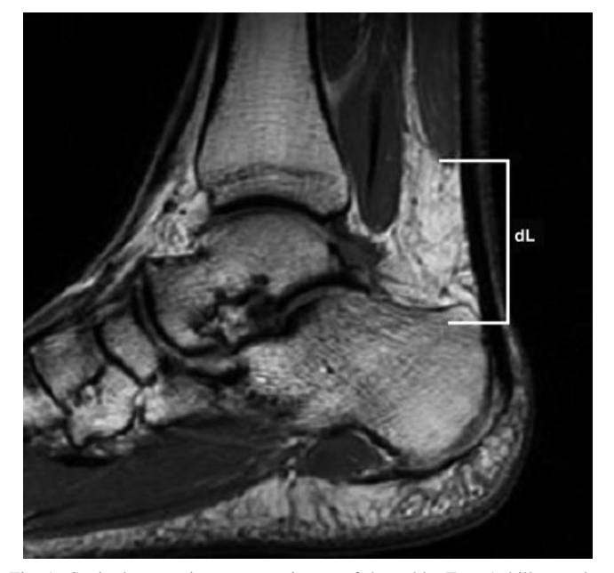
Fig. 1. Sagittal magnetic resonance image of the ankle. Free Achilles tendon length (dL) is defined as the distance from the most distal insertion of the soleus muscle in the Achilles tendon to the distal insertion of the tendon at the calcaneus.

for all three individual muscles were summed to give the maximal triceps surae ACSA.