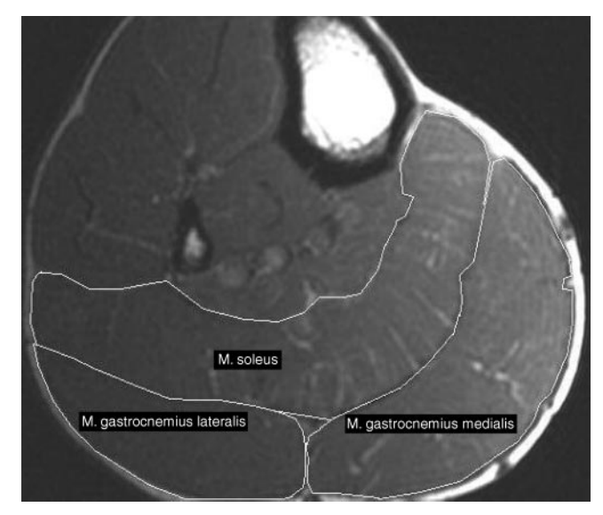
Fig. 3. Axial magnetic resonance image of the triceps surae muscle group. Cross-sectional areas of the muscles used for calculation are outlined.

strength parameters were normalized to body mass to the power of \frac{3}{4} (m<sup>3</sup>/<sub>4</sub>). The power of \frac{3}{4} was chosen because allometric parameters that relate surfaces (e.g., tendon CSA) to body mass are closer to \frac{3}{4} than to the 2/3 predicted by geometric similarity (32). The free Achilles tendon lengths were normalized to leg lengths (% of leg length).